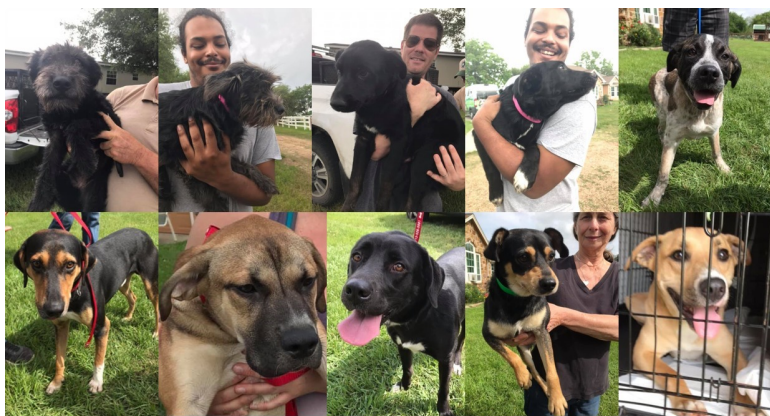
Pansy, Petunia, Cole, Jasper, Roscoe, Jake, Savannah, Julie, Ralph, Abby

The Animal Control Officer in Brookshire, TX recently reached out to us for help. He explained that he oversees Brookshire and Waller counties, and that his facility is not open to the public and does not adopt dogs out. There are 18 kennels, and when they are full, he must euthanize dogs in order to take in more. He explained that it is the absolute worst part of his job, so he was reaching out to Chances to see if we might be able to transport some highly adoptable dogs up north. We are thrilled to report that in the past 3 weeks, thanks to our newly forged partnership with Brookshire's ACO, we have been able to help save 10 wonderful dogs (Jake, Abby, Julie, Ralph, Savannah, Roscoe, Petunia, Pansy, Cole and Jasper) – all of whom have already been adopted into loving families up north!